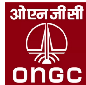
Oil and Natural Gas Corporation